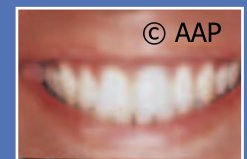
A behind-the-scenes look at a single-tooth implant.