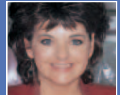
Look at the beautiful results of a dental implant!